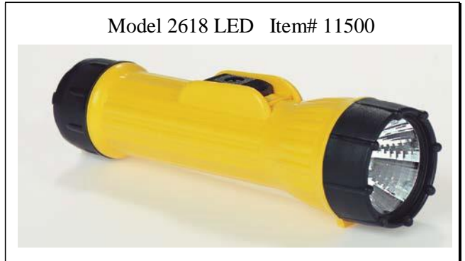
Model 2618 LED Item# 11500

Lens Ring: Polypropylene Lens: Polycarbonate Reflector: Polycarbonate Tube: Polypropylene Contact Strip: Phosphor Bronze Switch: Polyethylene Bottom Cap: Polypropylene